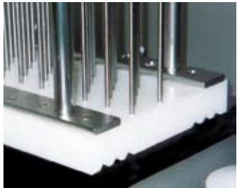
Down holder with brine recovery system

Conveyor belt according the food law out of plastic easy to clean through removing of the belt without any tools Brine pre filter out of stainless steel, easy to remove for cleaning