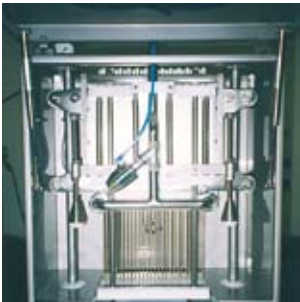
Adapter for poultry