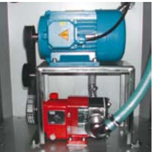
Lobe pump out of stainless steel for high injection and dense birne