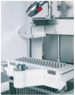
Quick-change needle system