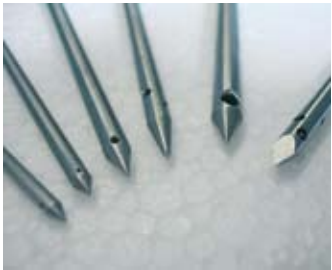
Different needle types