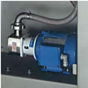
Impeller pump out of stainless steel