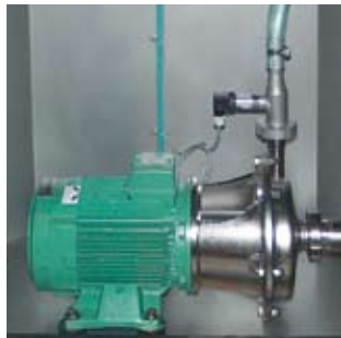
Centrifugal pump standard for industrial machines