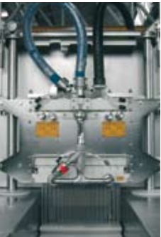
Detail needle bar